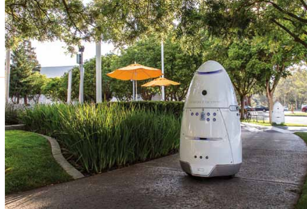
Knightscope created the K5, a robot used for crime prevention and detection. The first K5's were deployed in 2015. They are currently being marketed for outdoor venues, such as college and corporate campuses in the Silicon Valley area, but the company plans to use them for many purposes nationwide.

Stephens said over $13 million has been raised for the venture with a number of